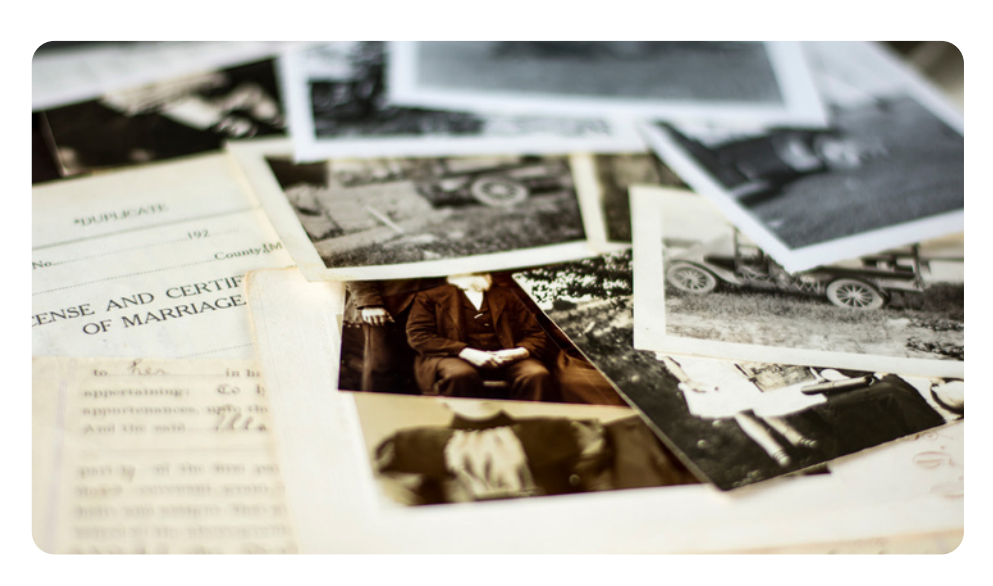
The past is made of events that have already happened.

Read these interesting facts about the past and changes over time with a parent, carer or teacher.