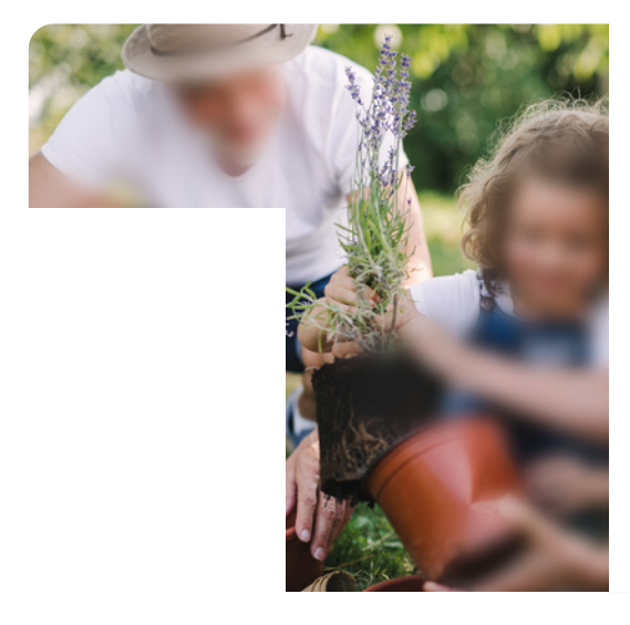
People grow from being babies to adults. As people grow older, they look different and can do different things.