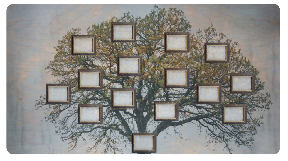
All families are unique. They can be of different sizes and have different values, beliefs and traditions. Our families give us our heritage.