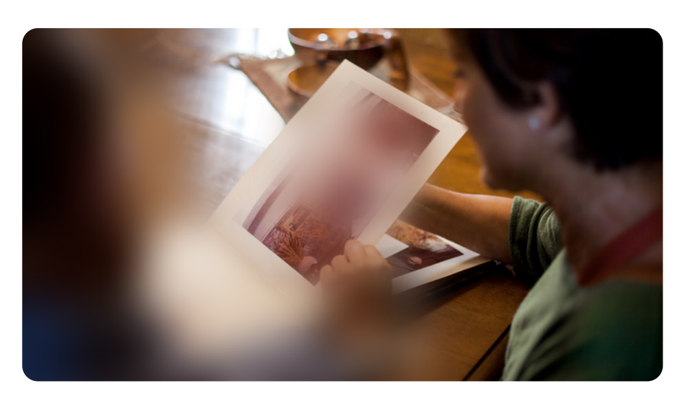
Memories are things we remember from the past.