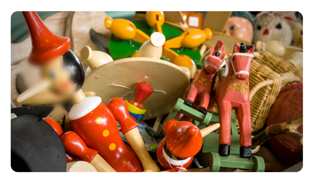
Everyday objects, like clothes, vehicles and toys, tell us about the past. They also change over time.