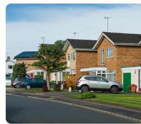
A street today.