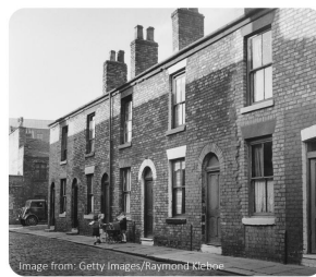
A street in the 1950s.

The way people use land changes over time. For example, in the 1950s there were fewer cars, so fewer roads were needed. Today lots of people have cars, so there are many more roads for people to drive on and driveways for parking.