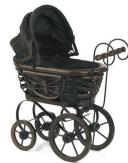
wood and metal pram