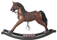
wooden rocking horse