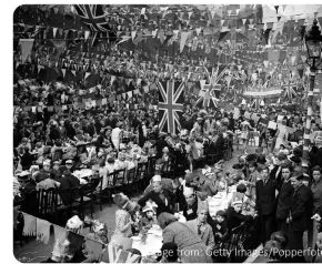
Street party to celebrate the coronation.