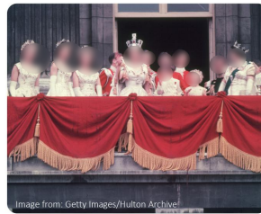
Queen Elizabeth II on her coronation.

A coronation is a ceremony where the crown is placed on the head of the new king or queen. Elizabeth II is the Queen of the United Kingdom. The coronation of Elizabeth II took place on 2nd June 1953 at Westminster Abbey, London. Many people celebrated the coronation by holding street parties.