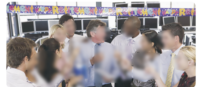
Retirement happens when an elderly person leaves work.