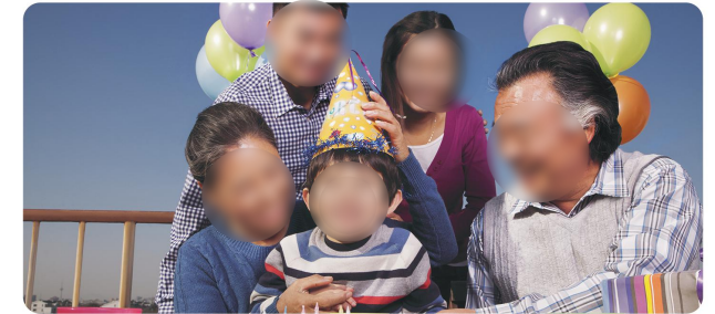
Birthdays happen every year.

Important life events include birthdays, religious festivals or family celebrations. Some life events happen every year and some happen at certain stages of human life.