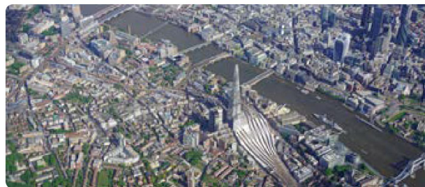
Aerial view of London

A city is a large, busy settlement where lots of people live and work. A city usually has a cathedral, a river, important buildings and offices where people work. There are lots of things to see and do in a city. There are many shops and restaurants to visit.