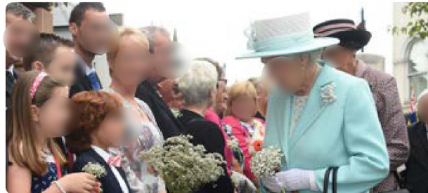
The Queen meets lots of people

Elizabeth II is the monarch of the United Kingdom. She was born in 1926 and became queen in 1952. She was married to Prince Philip and has a large family. She lives in Buckingham Palace in London. The Queen is very important. She visits charities and schools in the United Kingdom and welcomes world leaders to Buckingham Palace.