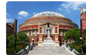
Royal Albert Hall